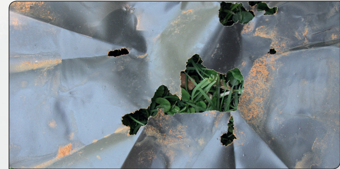
Research has shown that termites can and do breach plastic membranes as shown above.

Macrotermes natalensis and Odontotermes latericius , being less widely distributed in South Africa, infest buildings less frequently than Odontotermes badius . The dominance of Odontotermes badius and Macrotermes natalensis , as destroyers of sound timber in structures, applies to Botswana and much of South Africa, to the Gariep River, and along the eastern coastal belt as far south as Kei River. Along the arid western coastal belt from van Rhynsdorp in the south through Namaqualand into Namibia, Psammotermes allocerus of the family Rhinotermitidae is the chief problem species.